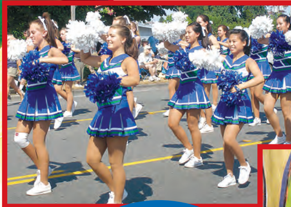
The Shorewood Drill Team was part of the Shoreline School District and Shoreline Community College joint Parade entry.