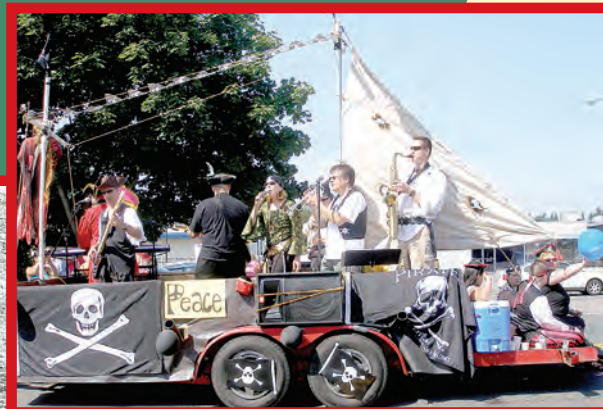
The Shoreline All Stars hit the Parade with their pirate float and band.

The Sunday Sandcastle Contest at Saltwater Park drew 28 entries.